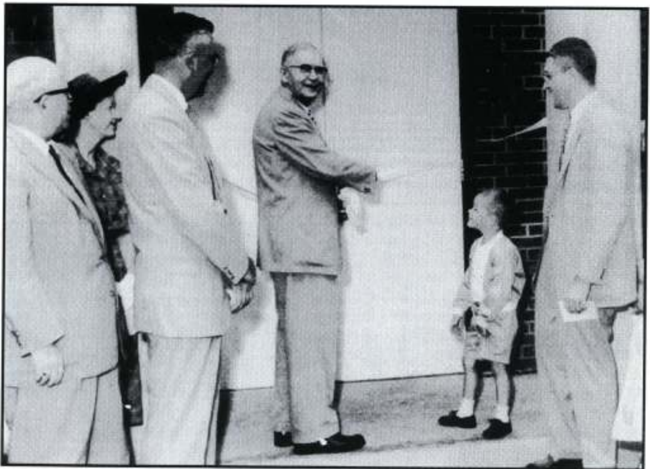
Dedication of the new Education Building, October 13, 1963