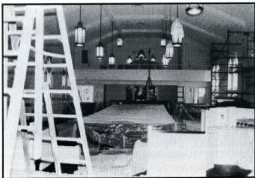
TRINITY SANCTUARY RENOVATED (August 11, 1985)